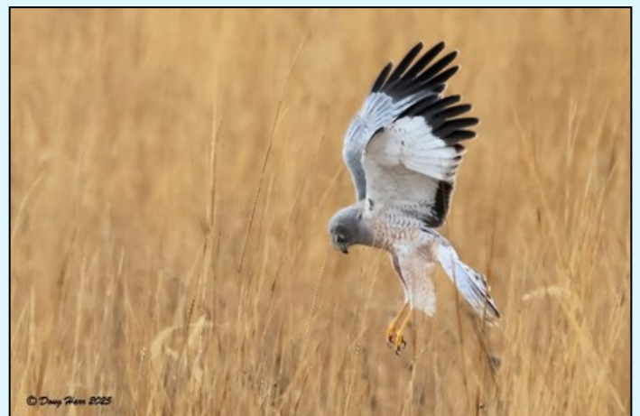
Northern Harrier, an Iowa endangered species that must have more prairie habitat to survive here

Wyoming is one of America's most conservative states, but does all it can to save and restore its natural lands, even on private property. That's because they know just how much hunting, fishing, hiking, birding, and all kinds of outdoor recreation mean to the state. Iowa is far more important for crop farming than Wyoming, basically just a grazing livestock production state, but we must still protect all the tiny amounts of our remaining natural lands. That will allow Iowans and visitors to enjoy our outdoors, whether it's birding in the Loess Hills, paddling the Raccoon River, fishing at the Iowa Great Lakes, hiking the Heart of Iowa Nature Trail, hunting in the Kellerton area's famous grasslands, or biking the Duck Creek Parkway. Whatever happens in this year's legislative session or in future years, we must always do everything possible to stop destruction of our natural resources. This is the mission of Iowa Audubon and all of our conservation alliances.